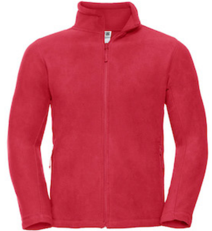
870M Men's Full Zip Outdoor Fleece SIZE XS-4XL

MATERIAL: 100% Polyester Anti-Pill Fleece